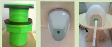
Zerodor Urinal Trap Waterless Urinal with Zerodor (Front View & Back View)

NOWA Urinals use a ground-breaking odour trap called Zerodor. It does not require replaceable parts or consumables. This results in low maintenance costs as compared to other solutions in the market like sealant liquid traps, membrane traps & biological blocks.