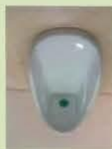
RETROFITTING ZERODOR TO URINALS